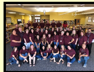
Our AWESOME Villago Staff!

A note from Mrs. Robbins:... Happy October! We have a busy month here at Villago. We will have Brown Bag Lunch on Friday, October 5. Please join your student for lunch that day. You can bring food with you from a local restaurant or purchase a lunch from our school cafeteria. We have several picnic tables around campus for you to enjoy your lunch in our courtyard or have lunch indoors in our media center.