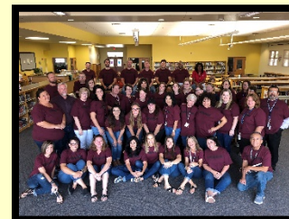
Our AWESOME Villago Staff!

Villago Middle School 574 E. Lakeside Parkway Casa Grande, AZ 85122